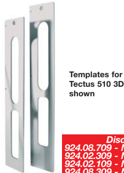
Templates for Tectus 510 3D shown

Discontinued 924.08.709 - No longer available 924.02.309 - No longer available 924.02.109 - No longer available 924.08.309 - No longer available