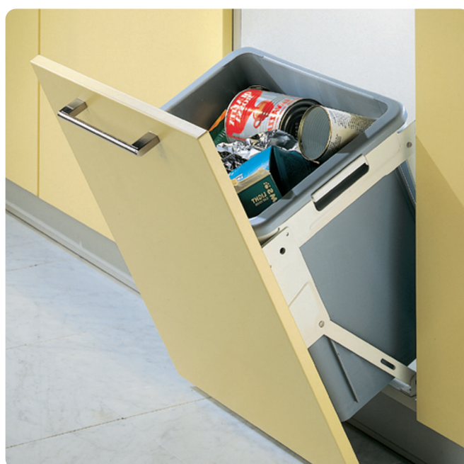
Photo added 'white finished lid has slightly different design'