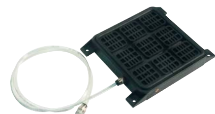
Single sided vac-clamp