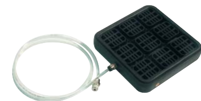
Double sided vac-clamp