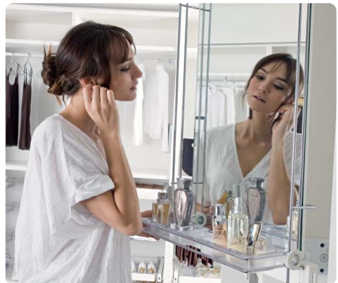
Elite pull out pivoting mirror with white fitting and multi-purpose tray