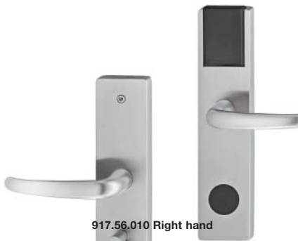
917.56.010 Right hand