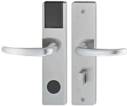
917.56.000 Left hand