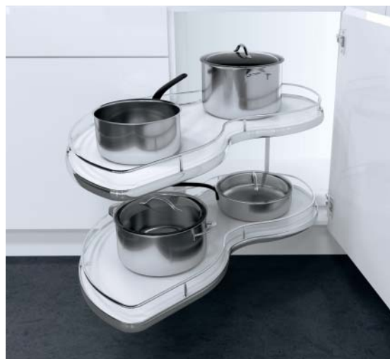
Shelves pull out together, left hand version