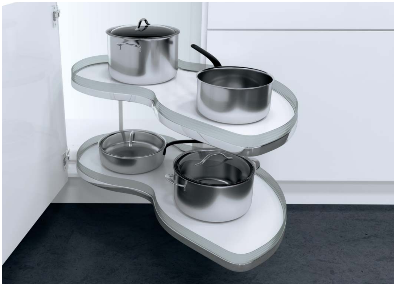
Twin corner pull out shelving unit, white base with Plexiglass sides, right hand version

Designed so that the pull out section automatically begins to pivot as the unit is pulled out of the cabinet.