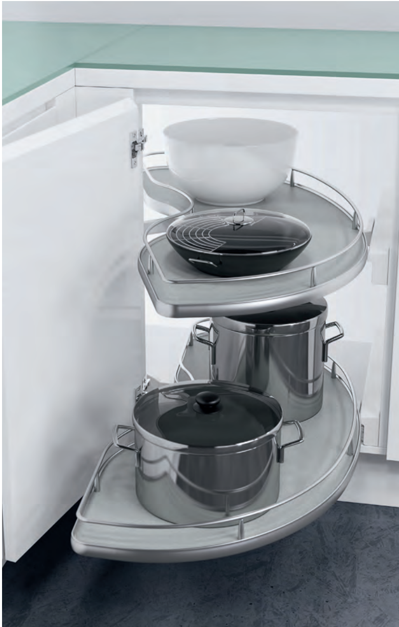
Slide corner pull out shelving unit, grey base with silver rail, right hand version

Shelves do not obstruct adjacent cabinet when pulled out and pull out independently of each other