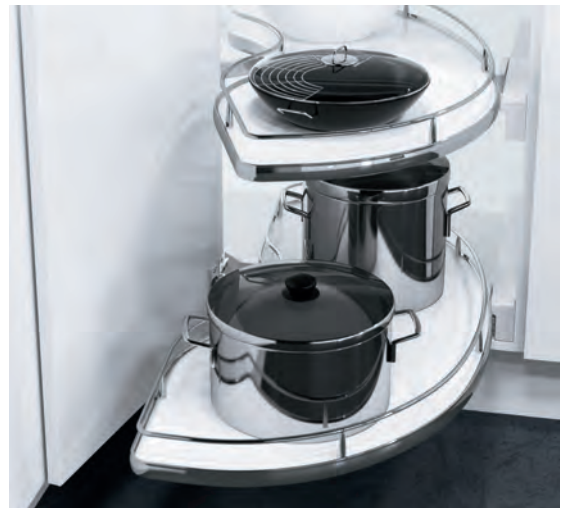
Shelves pull out independently of each other