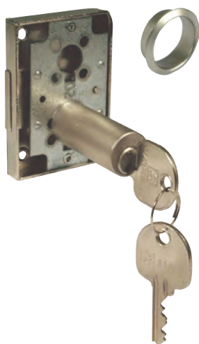
Right hand version