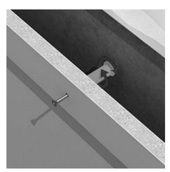
Wind the Space-Plug until it firmly contacts both surfaces