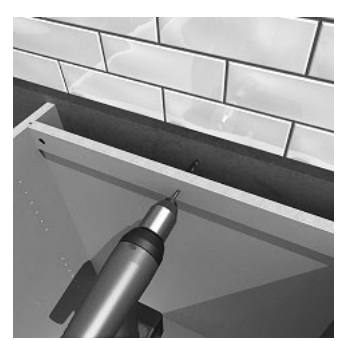
Drill a pilot hole (same size as your masonry bit) through the cross brace, then, with your 200 mm drill bit, drill directly into the wall behind and inset your wall plug