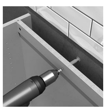
Tighten the screw