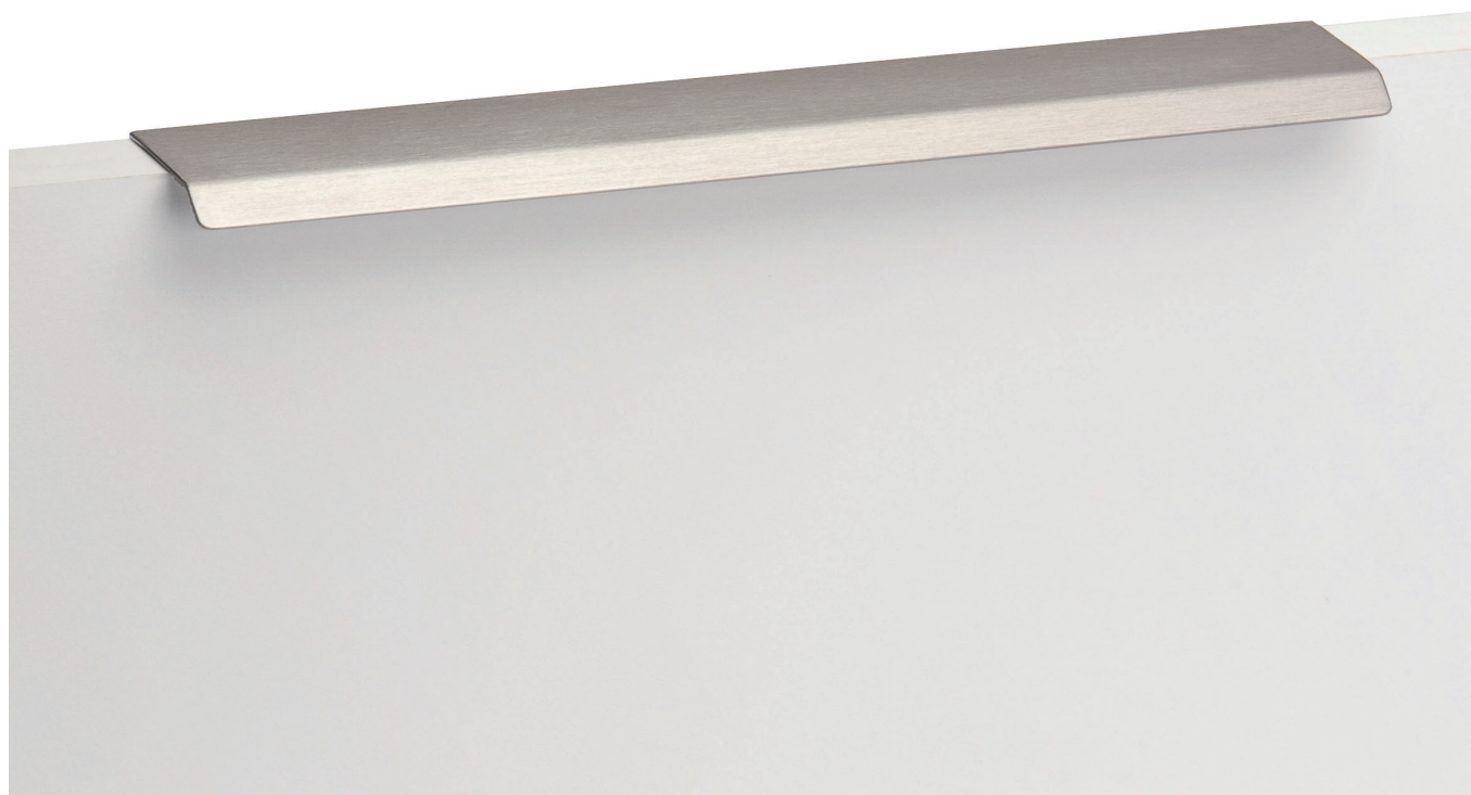
CURVE profile handle