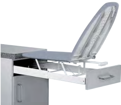
Simply pull the drawer open and unfold the ironing board