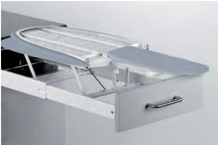
Optional sleeve arm available