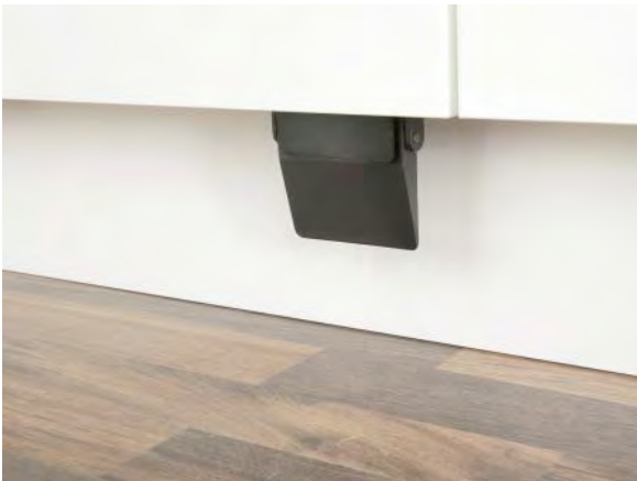
Foot pedal for hinged door cabinets is shown on page 148

Other door operating systems are available