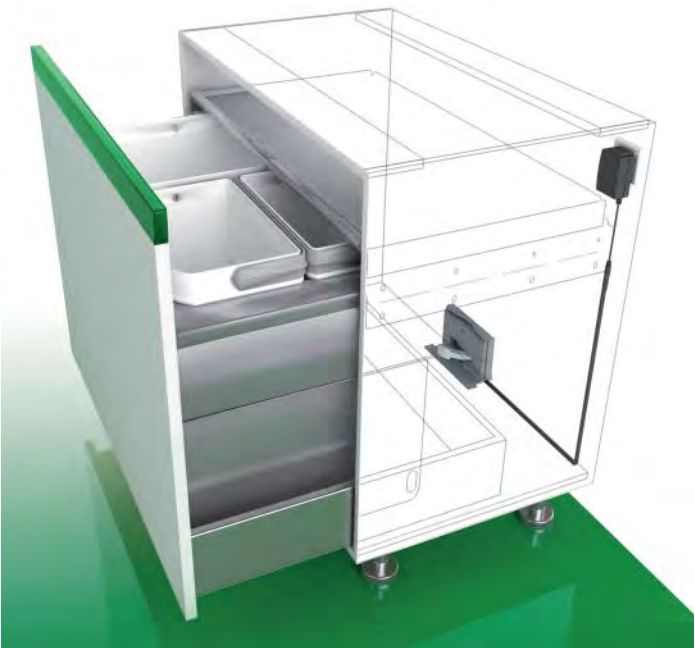
Sensomatic door opening system, ideal for waste bin drawer systems is shown on page 149