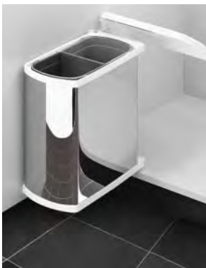
Duo with 2 bins