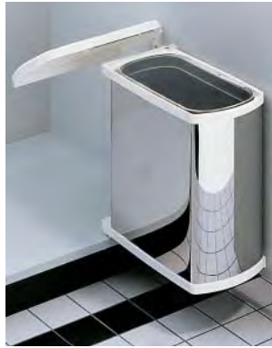
Uno with 1 bin, stainless steel