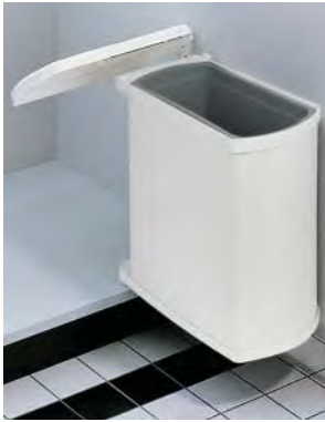
Uno with 1 bin, white