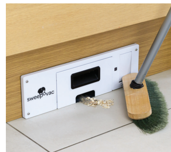
...or by broom.