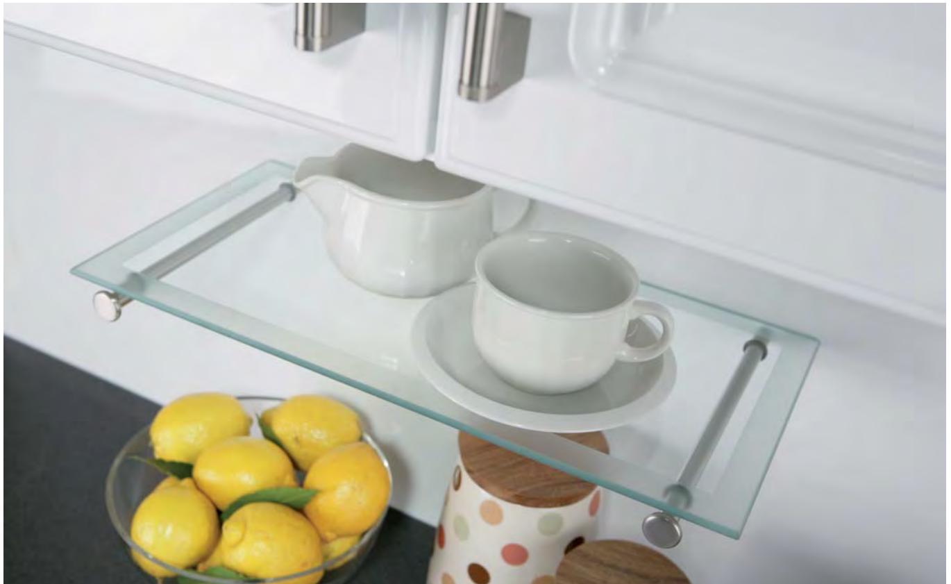
Shelf support set, for 220 mm deep shelves

Supports come with rubber rings for glass shelves but these shelf supports can also be used for other types of shelves such as wood or MDF.