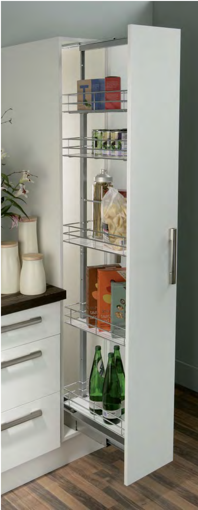
Baskets are included with larder unit sets, optional white base inserts available to order separately