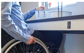
Safety strips ensure that worktops don't just stop, but reverse their movement immediately when activated.