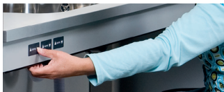
Control switch - For adjustment of worktop and cupboard height. Included with control box. Buttons are easy to read and operate