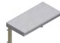
600-3000 mm width