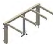
650-950 mm height