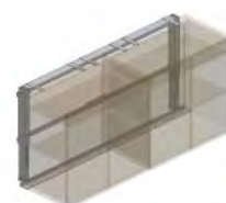
600-2000 mm width