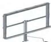
250 mm height adjustment 65 mm frame depth