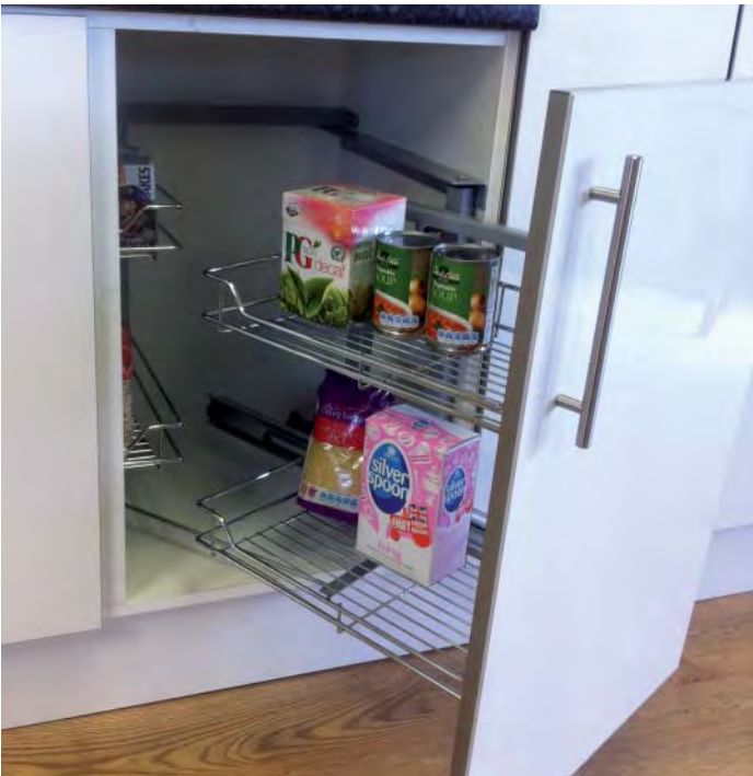
Right hand version shown

Soft closing storage unit for corners with four linear silver wire baskets included.