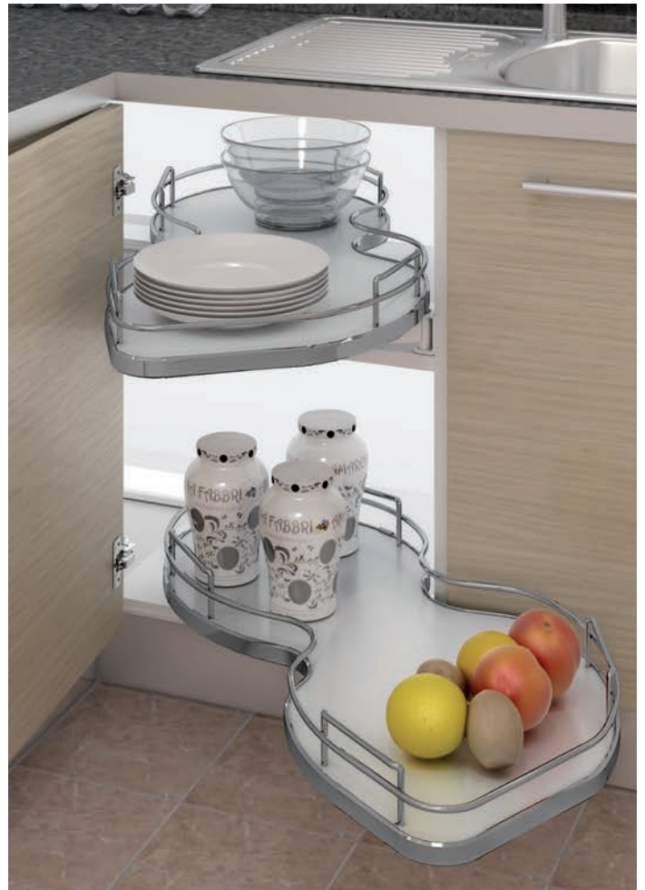
Photo shows right hand version

Ideal for retrofitting. Shelves operate independently of each other. Available with white or grey shelves.