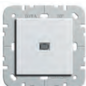
With neon light