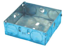
80 mm U.K. back box