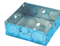
80 mm U.K. back box