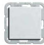
71 mm insert