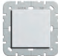
80 mm insert