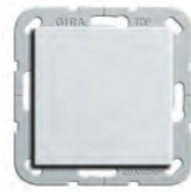
71 mm insert