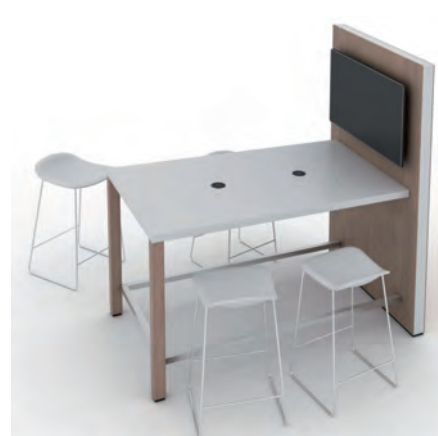
Wireless charging wherever you want.