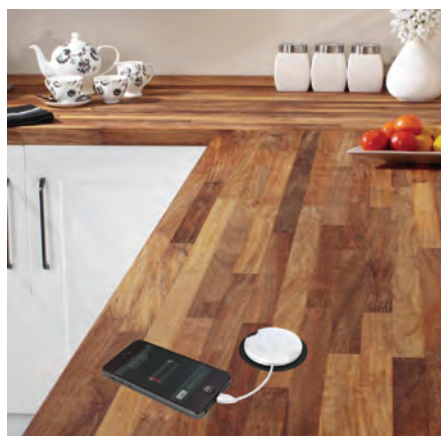
Charge in the kitchen.