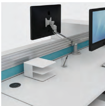
Charge at your desk.