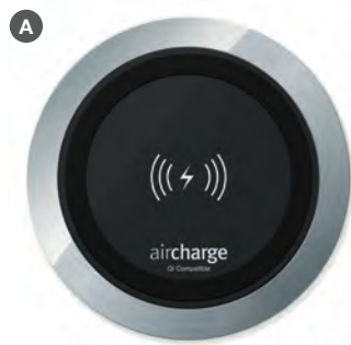
Black and aluminium finish