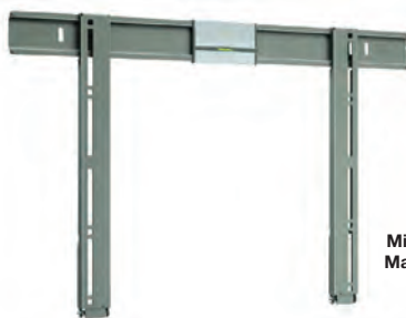
THIN 305 Width x height: 660 x 437 mm