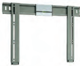
THIN 205 Width x height: 490 x 337 mm