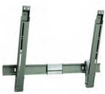
THIN 315 Width x height: 660 x 435 mm