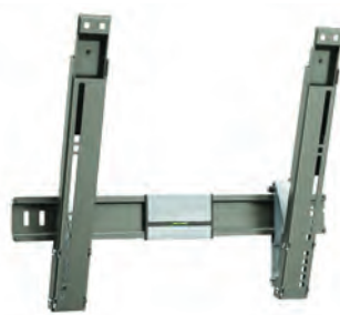
THIN 215 Width x height: 490 x 345 mm