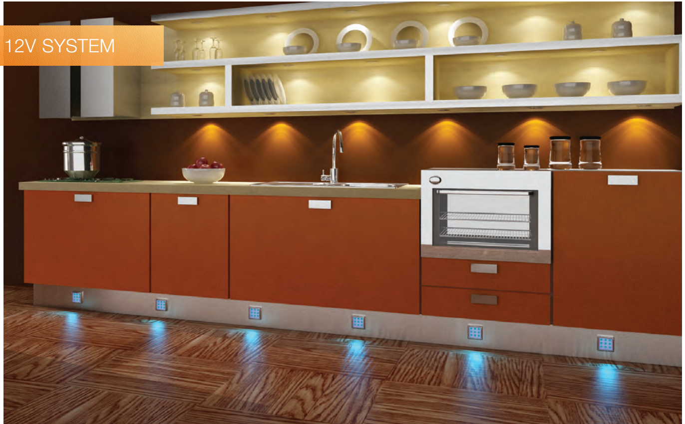
Loox 12V LED 2010 RGB colour change light, 52 mm

The LED 2010 is the right choice if you wish to create a design feature of changing light colour in a small amount of space. Suitable for use as a downlight or for use in plinths.