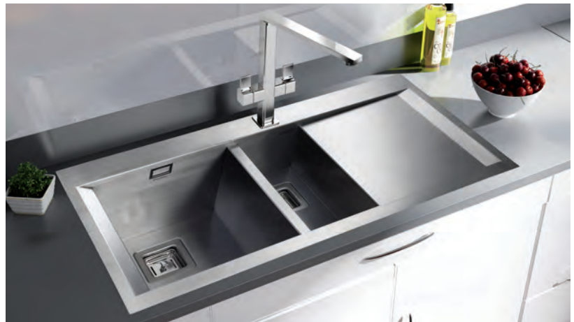
Photo shows sink with right hand drainer. Taps are not included with these sinks - tap shown is Metrix 569.55.280/480, see page 113 for details

High quality 18/10 stainless steel for improved lustre, stain and rust resistance