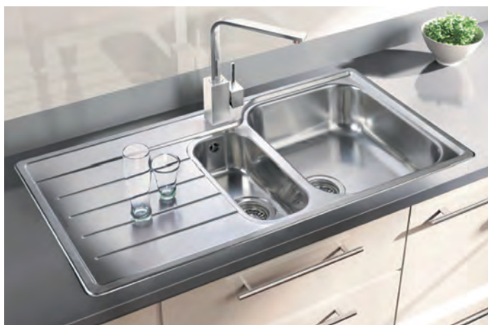
Photo shows sink with left hand drainer and Quadrant tap Cat. No. 569.54.400, see page 114 for details

The Oakland sink is a modern twist on a classic design. Offering a sleek and contemporary look, with a lustrous Micro-Sheen™ finish, the Oakland range includes a single bowl and 1 1/2 bowl version - a perfect solution whatever style of kitchen you choose, however big your family.