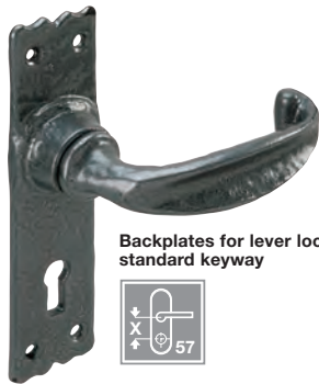
Backplates for lever lock, standard keyway