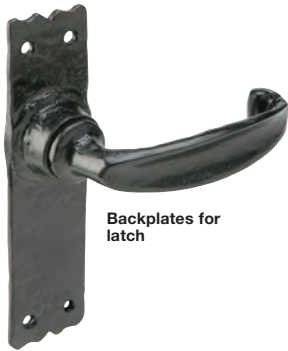
Backplates for latch