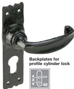
Backplates for profile cylinder lock