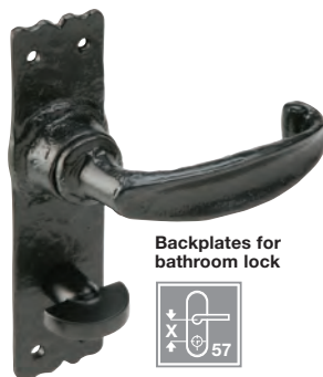
Backplates for bathroom lock