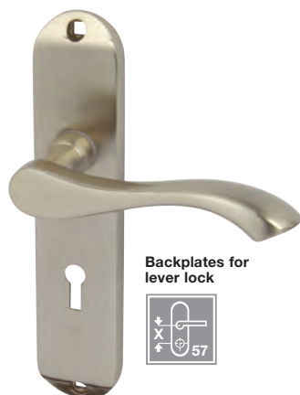
Backplates for lever lock