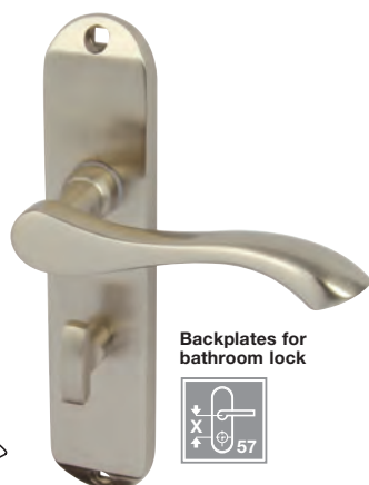
Backplates for bathroom lock