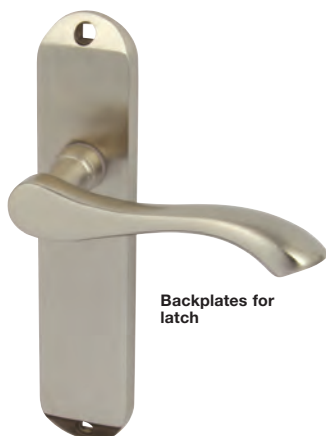
Backplates for latch