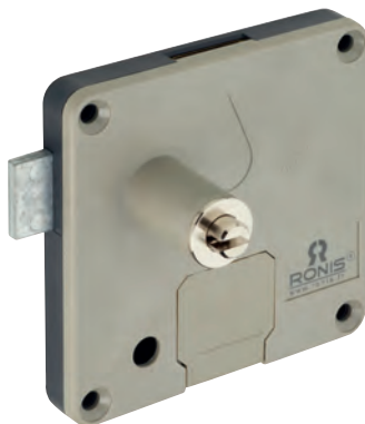
Right handed version shown