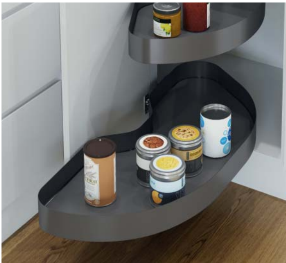
Right hand shown