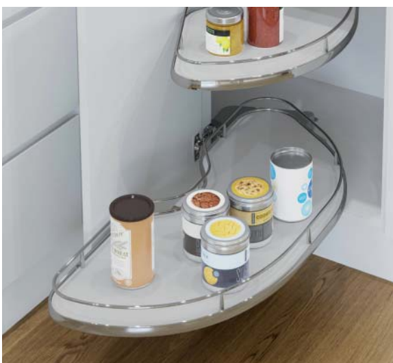
Right hand shown