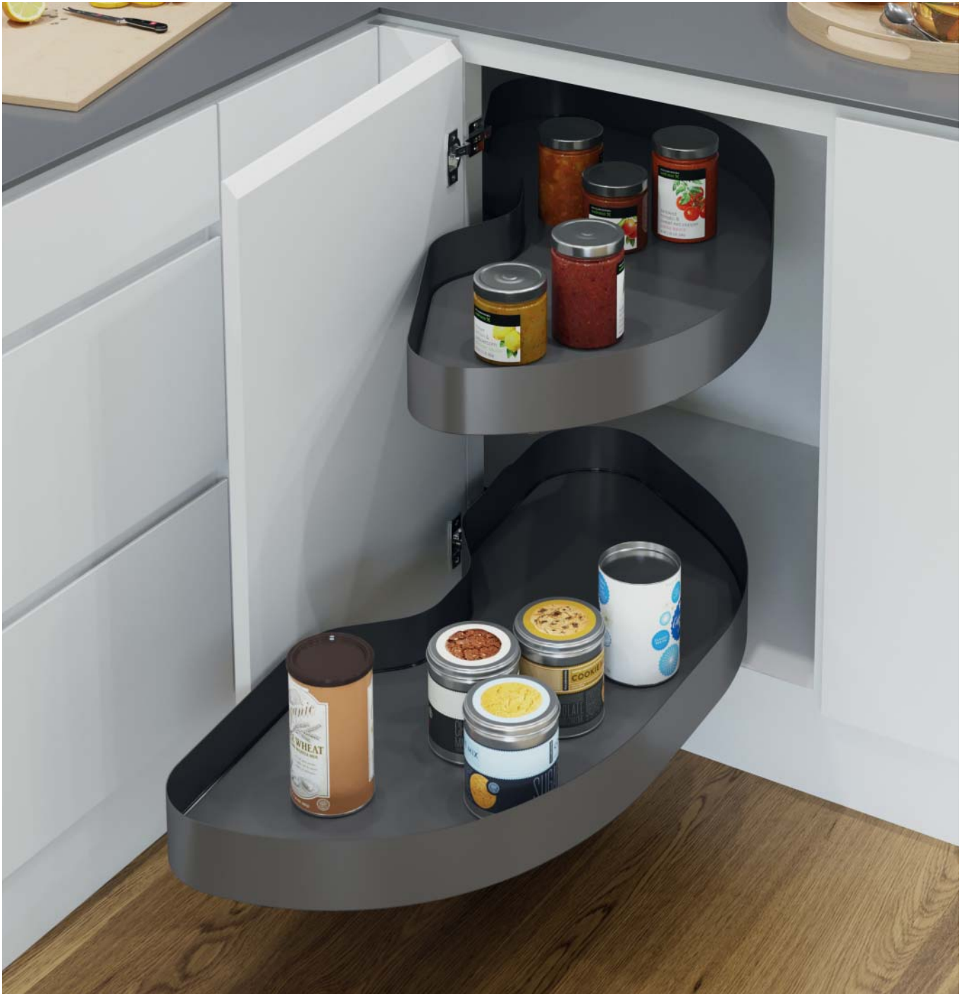
Cornerstone Maxx pull out shelving unit with Planero lava grey shelves, right hand

Kitchen Fittings and Accessories: Storage