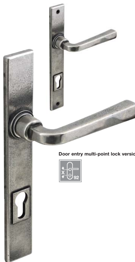
Door entry multi-point lock version