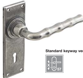
Standard keyway version

Note: ± 3 mm tolerance on non-critical dimensions and ±1 mm on hole centre dimensions