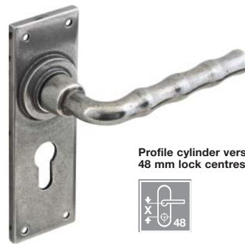
Profile cylinder version 48 mm lock centres