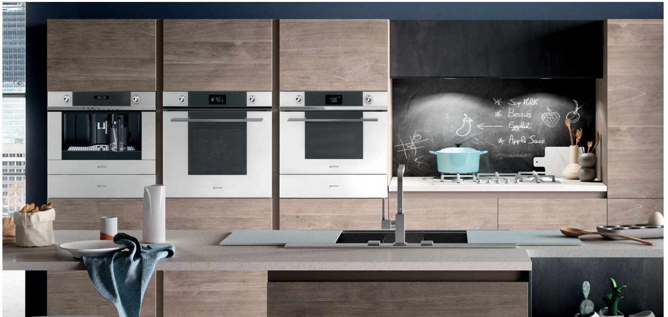
Smeg built-in Linea gas hobs are designed to co-ordinate perfectly with the range of Smeg Linea ovens, see from page 30-2004