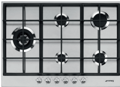
Stainless steel finish