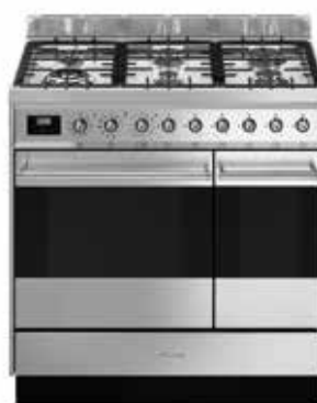
Stainless steel and black glass finish, dual fuel