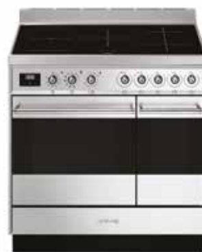
Stainless steel and black glass finish, electric induction