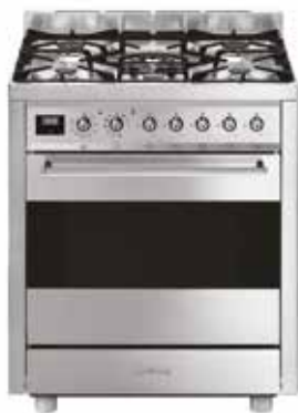
Stainless steel and black glass finish