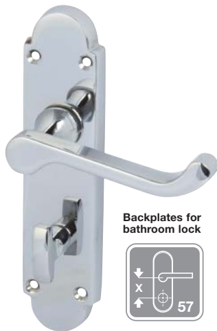
Backplates for bathroom lock