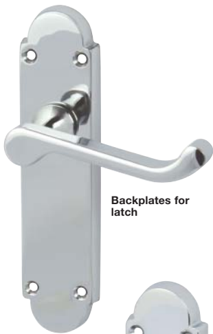
Backplates for latch