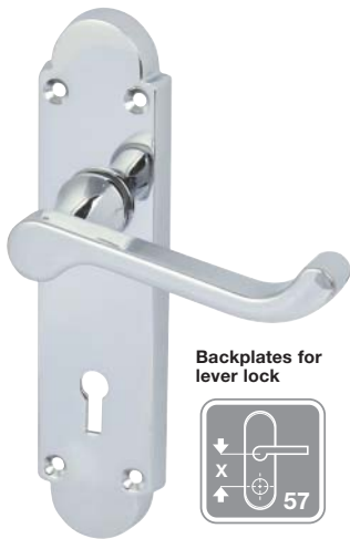
Backplates for lever lock