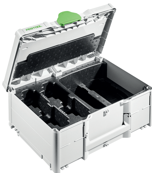
Systainer 3 SYS3 M 187 ENG 18V