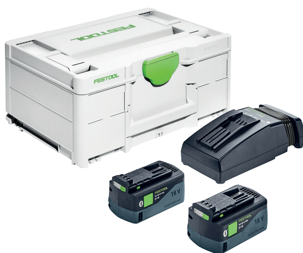
Energy set SYS3 ENG 18V 2x5.2/TCL6