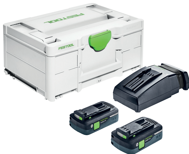
Energy set SYS3 ENG 18V 2x4.0/TCL6