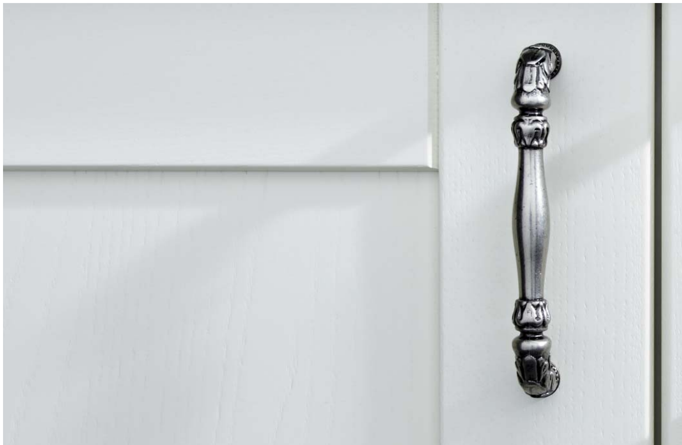
ACANTHUS handle with separate backplates