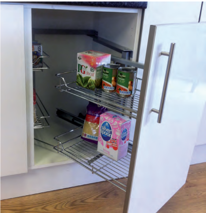
Right hand version shown

Soft closing storage unit for corners with four linear silver wire baskets included.