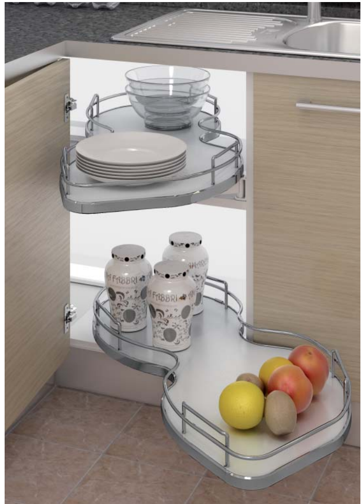
Photo shows right hand version

Ideal for retrofitting. Shelves operate independently of each other. Available with white or grey shelves.