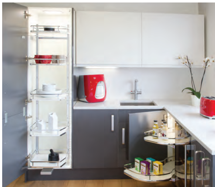
Co-ordinating Häfele larder unit shown on page 13

Häfele corner unit now available with flat bar railings. Ideal for retrofitting. Shelves operate independently of each other.