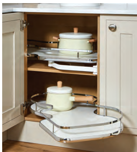
Right hand version, installed with pull out frame