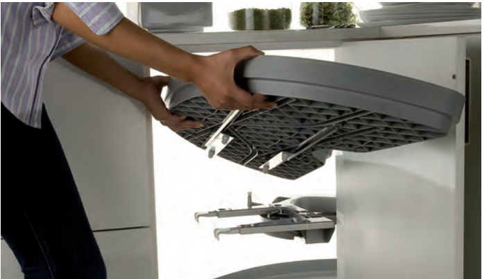
All trays are easy to remove for cleaning