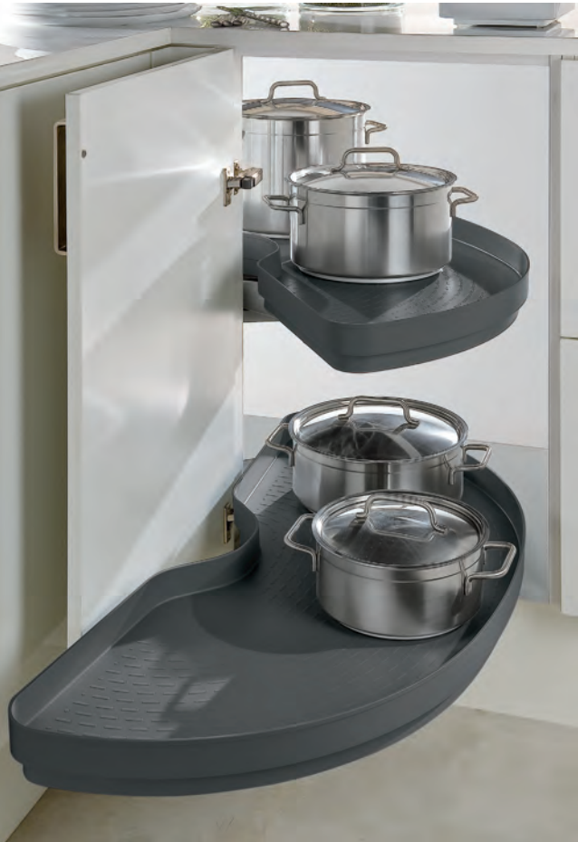
Right hand, dark grey version shown

Choice of white, grey or dark grey shelves, each set includes two shelves.