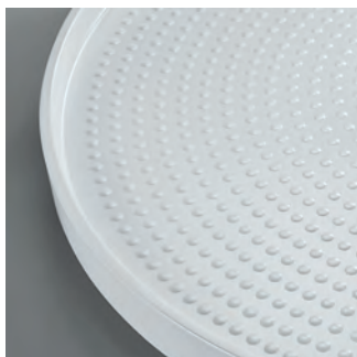
White eco trays