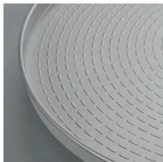
Grey pro)arc trays