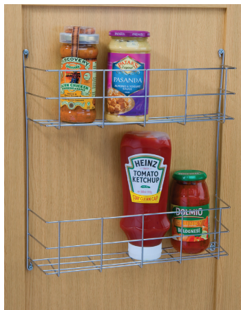
Photo shows linear 2-tier version,