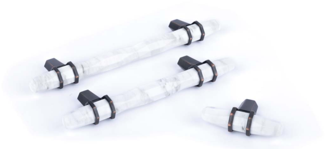
CARRIONE T knob