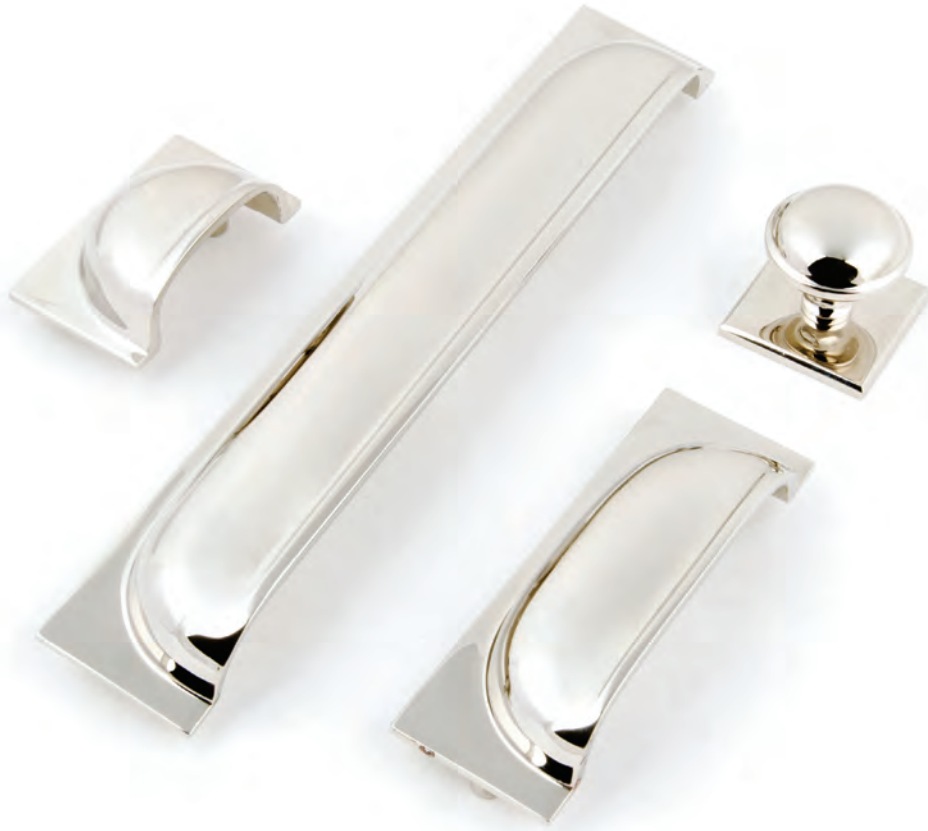
QUESLETT cup handle