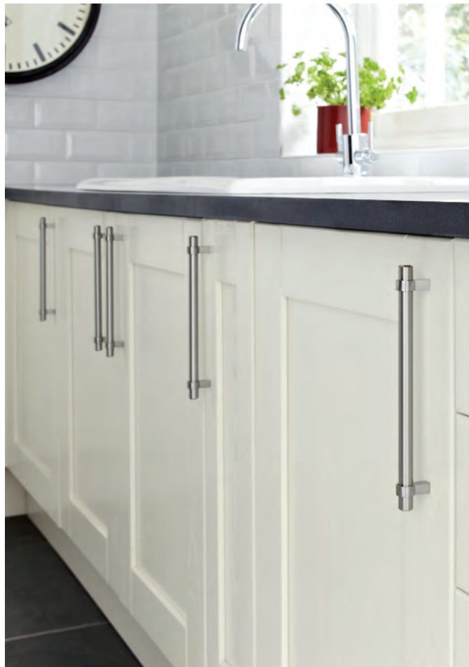
PIMLICO bar handle