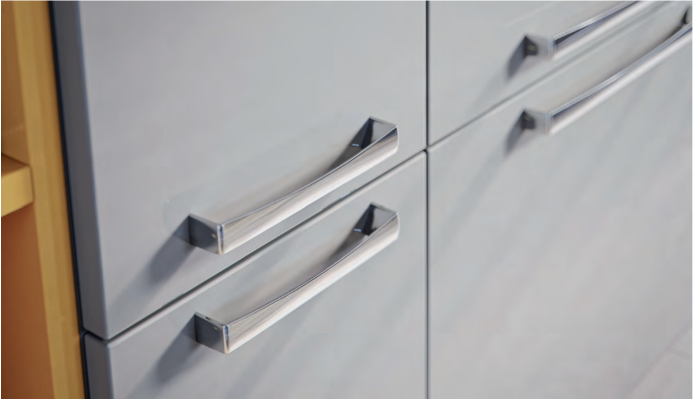
LAMA pull handle

TCH DESIGN 2017. © Häfele U.K. Ltd 2017. Dimensional data not binding. We reserve the right to alter specifications without notice.