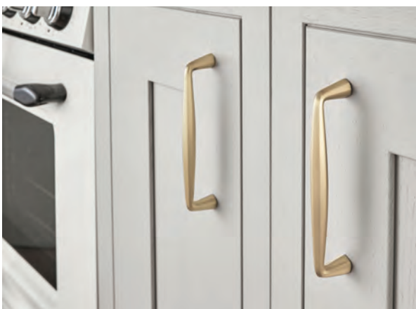
Burbridge and Chloeu, see pages 125-127

“ Brushed brass adds glamour whatever the application. ”