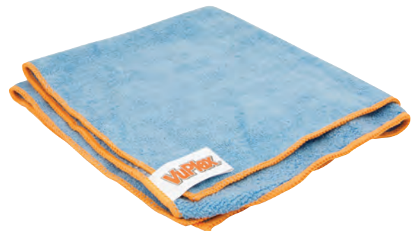
Micro fibre cloth 008.54.565

“ Remember, only ever use a dry cloth to clean a handle. ”